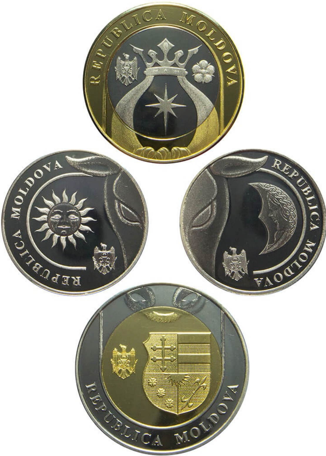
On the reverse side, the assembling of coins recreates the State coat of arms of the Republic of Moldova.