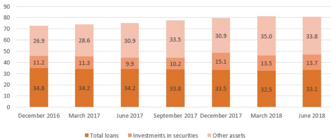
Assets in the banking sector, bil. lei

Investments in securities (certificates of the National Bank of Moldova and government securities) accounted for 17.1% of