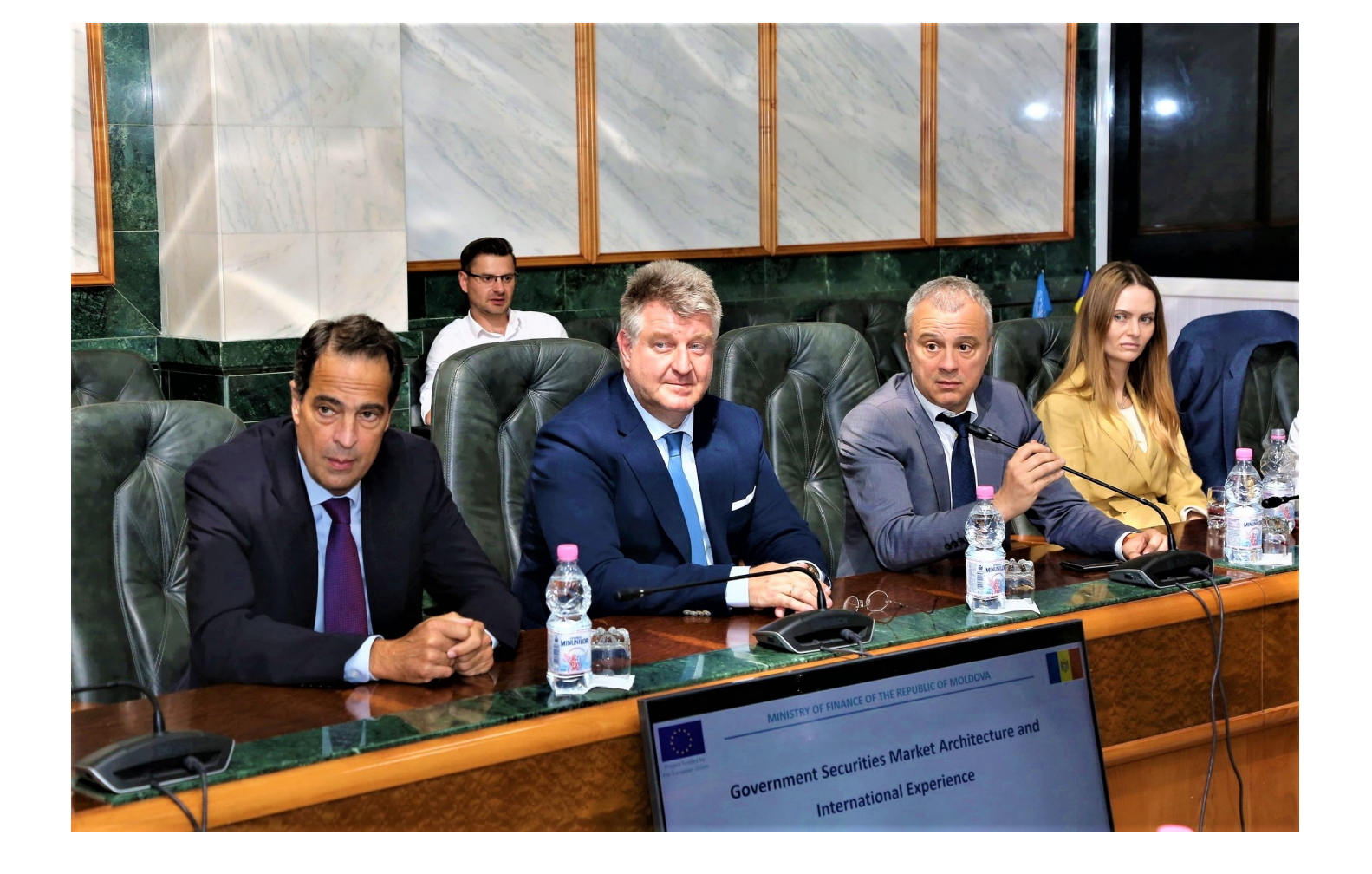
Tags the development of the Moldovan government securities market [1] the development of the government securities market [2]