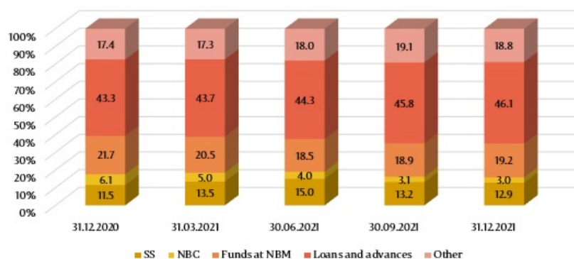
Structure of assets (%)

The gross (prudential) loan balance was 47.6% of total assets, or 56.4 billion lei, and increased by 23.5% (10.7 billion lei) during the examined period. At the same time, the volume of new loans granted during 2021 increased by 38.7% compared to the same period of the previous year.