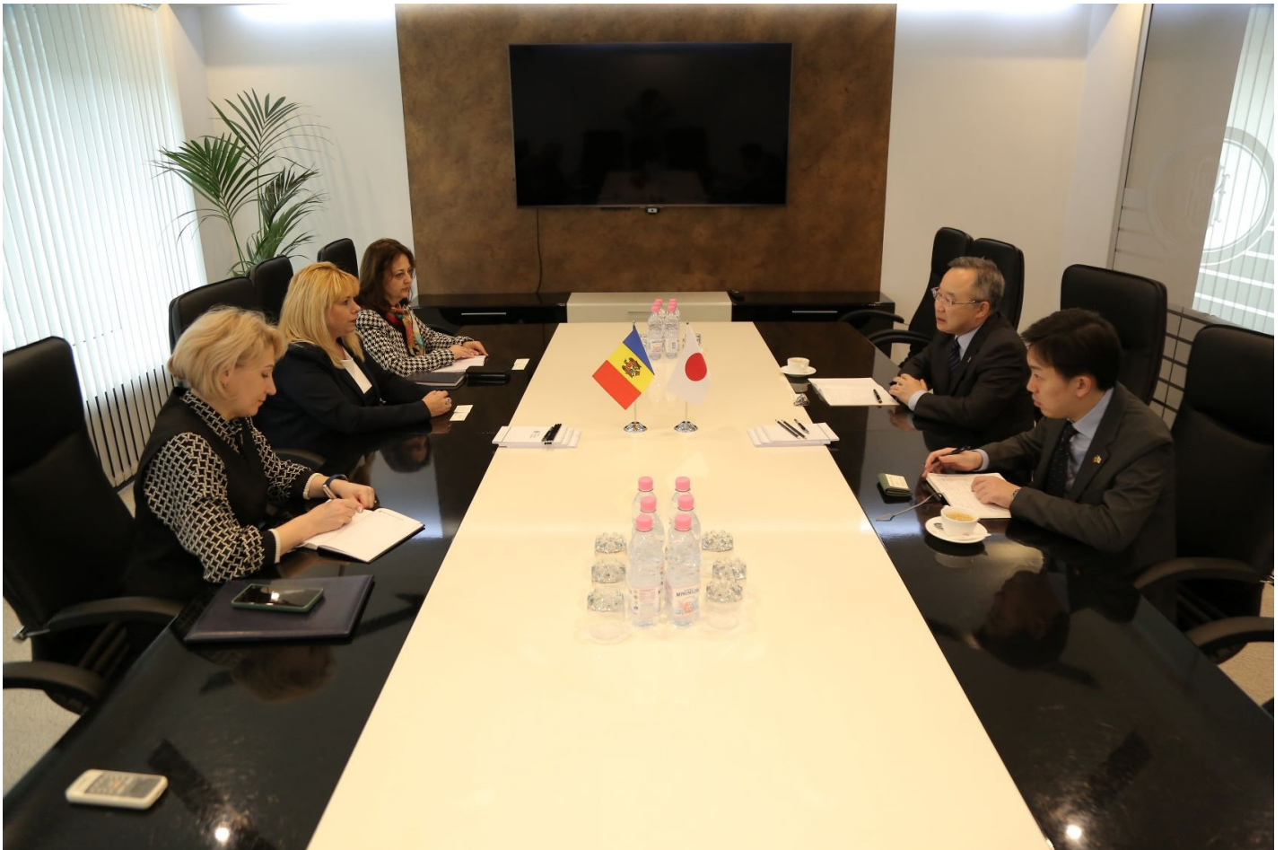
Tag-uri The Ambassador of Japan [1]