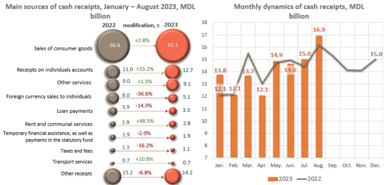
Chart 1. Main sources of cash receipts in licensed banks vaults and their monthly dynamics

The volume of cash releases from licensed banks vaults in January – August 2023 increased by MDL 2,063.2 million (+1.8%) compared to the same period of the previous year and amounted to MDL 114,696.2 million (Chart 2).