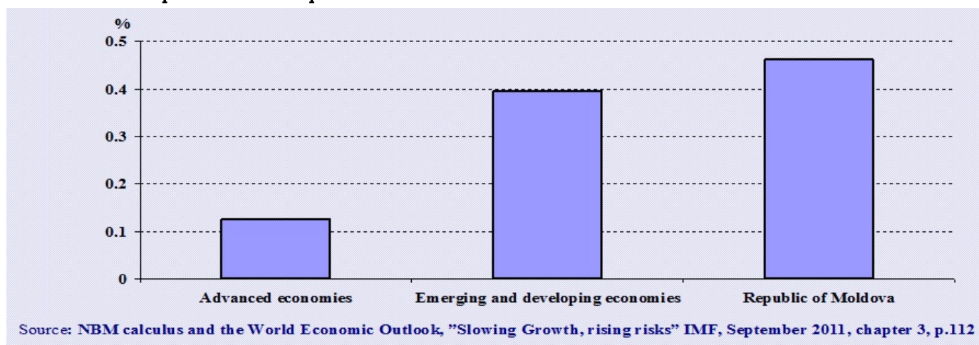
Chart no. 1. The impact of local food prices increases on overall situation

In case of fuel prices increase, the effect on core inflation growth is significant. An increase of 1.0 percent will have a cumulative impact on core inflation in the medium term of 0.33 percent. Food prices are also affected by an increase of 0.50 percentage points.